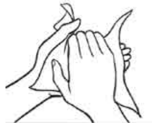
use a paper towel to dry hands & turn off the tap