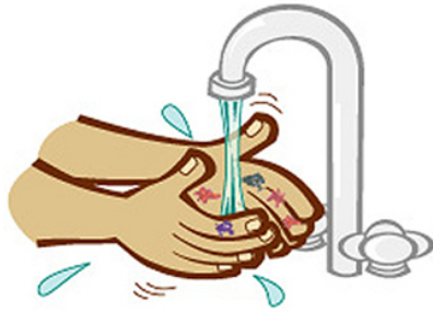
wet your hands with running water