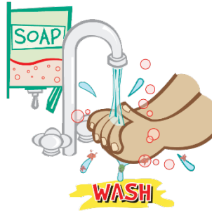
cover your hands with soap and rub your hands vigorously