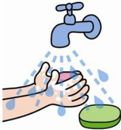
Rinse your hands thoroughly to remove all soap and germs