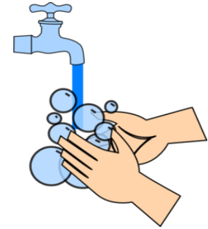
wash your hands all over, being sure to clean in between fingers, under fingernails, around wrists and both the palms and backs of hands