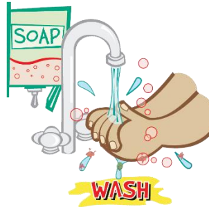
cover your hands with soap and rub your hands vigorously