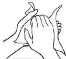
use a paper towel to dry hands & turn off the tap